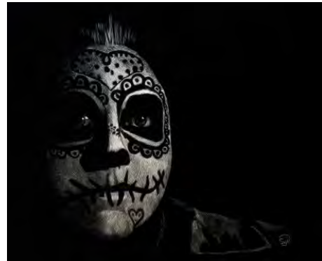
Sugar Skull Selfie

Here are the works mentioned in this current article. Our congratulations to this HAL artist on her continued recognition in this beautiful medium.